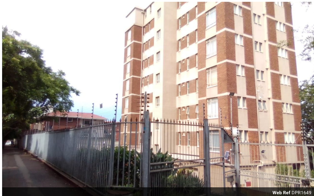
Web Ref DPR1649

3 Oslo Building 394 Ester Roberts Road Glenwood Durban 4001