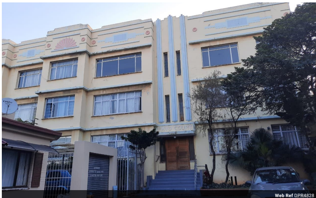
Web Ref DPR4828

3 Oslo Building 394 Ester Roberts Road Glenwood Durban 4001