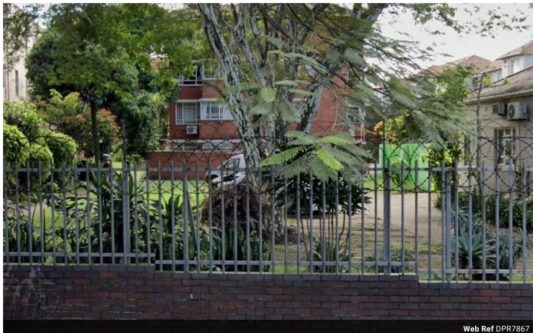
Web Ref DPR7867

3 Oslo Building 394 Ester Roberts Road Glenwood Durban 4001