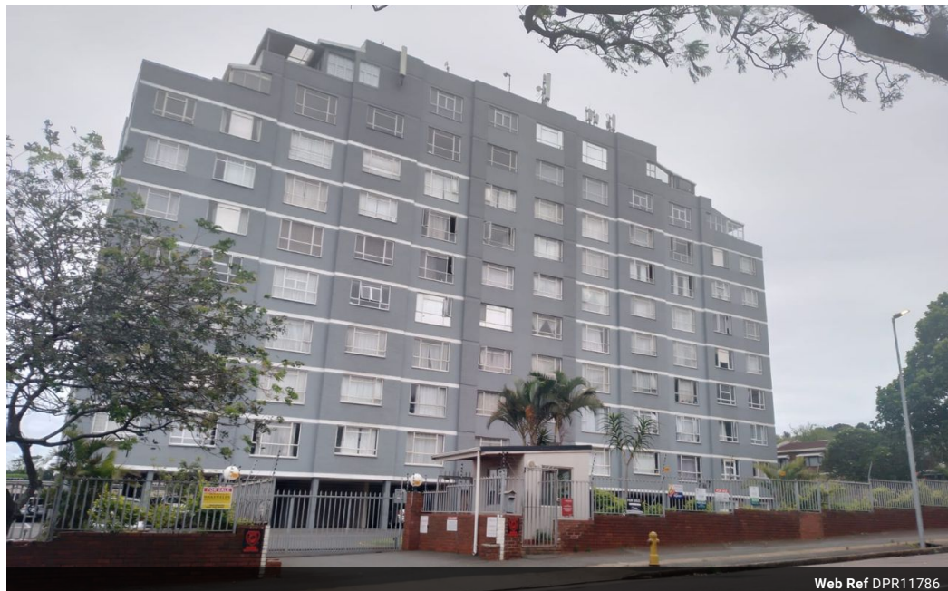
Web Ref DPR11786

3 Oslo Building 394 Ester Roberts Road Glenwood Durban 4001