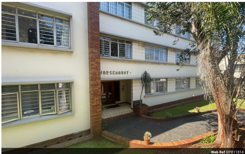
Web Ref DPR11814

3 Oslo Building 394 Ester Roberts Road Glenwood Durban 4001