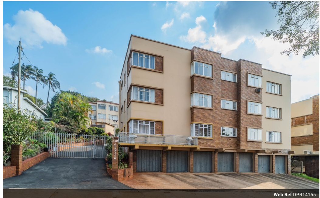
Web Ref DPR14155

3 Oslo Building 394 Ester Roberts Road Glenwood Durban 4001