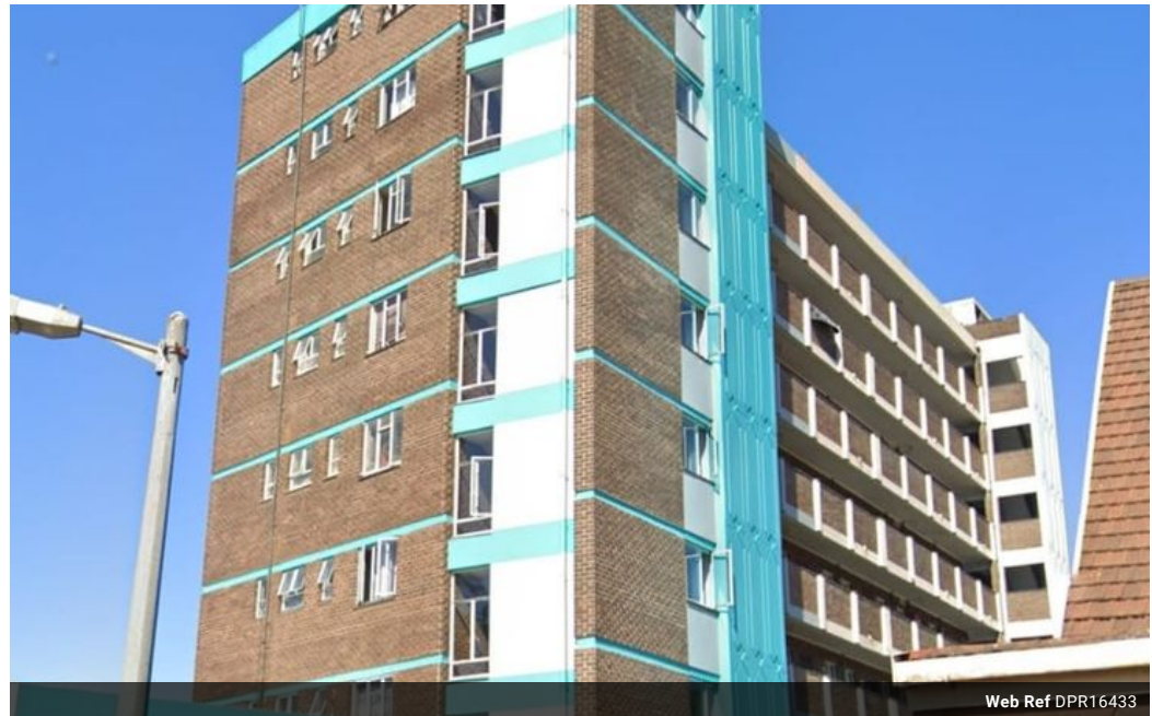
Web Ref DPR16433

3 Oslo Building 394 Ester Roberts Road Glenwood Durban 4001