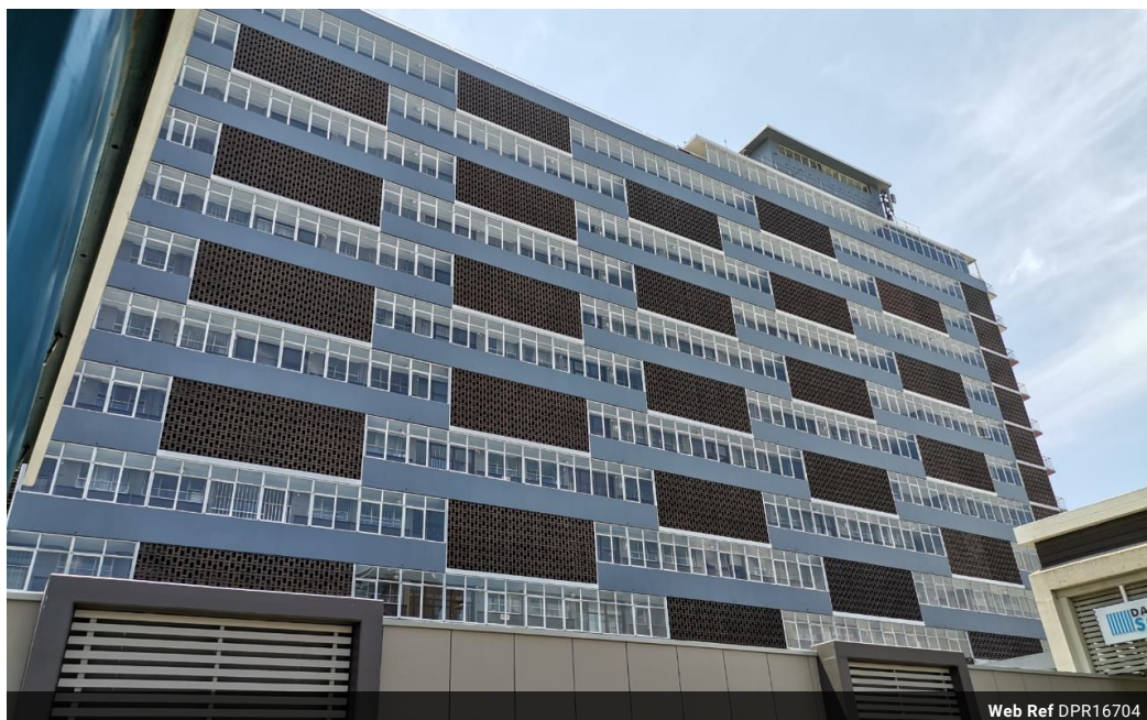
Web Ref DPR16704

3 Oslo Building 394 Ester Roberts Road Glenwood Durban 4001