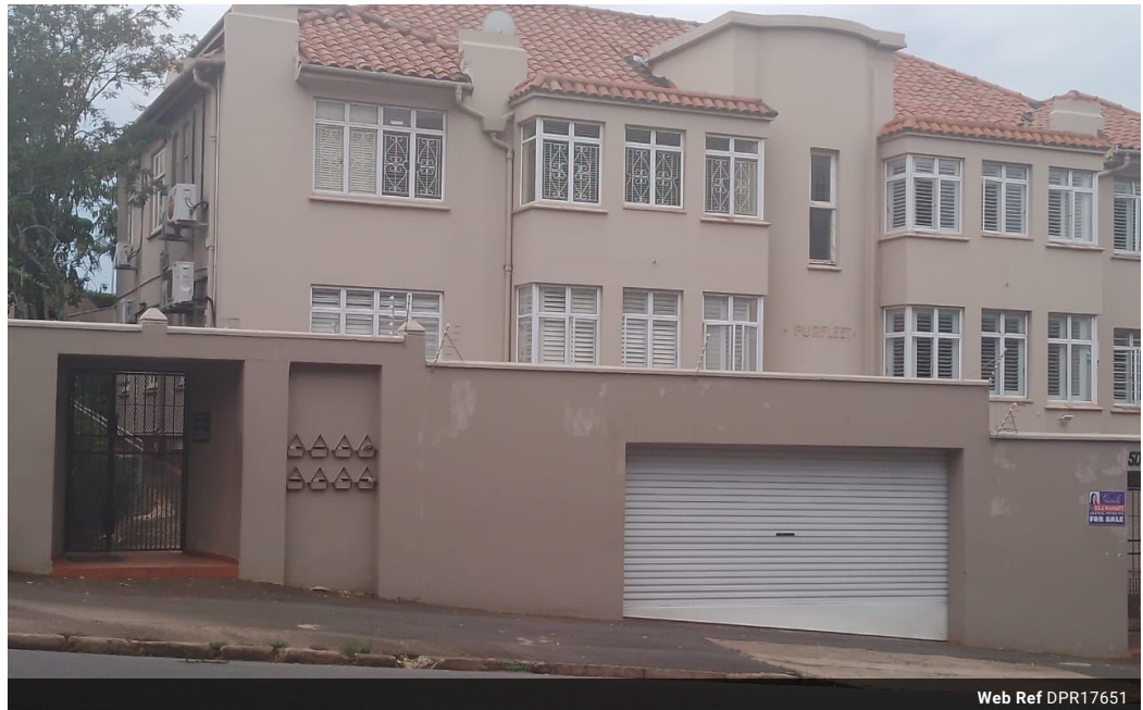
Web Ref DPR17651

3 Oslo Building 394 Ester Roberts Road Glenwood Durban 4001