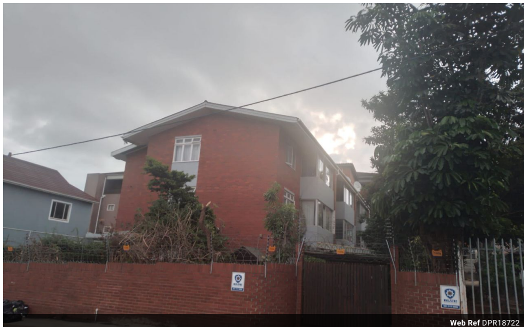
Web Ref DPR18722

3 Oslo Building 394 Ester Roberts Road Glenwood Durban 4001