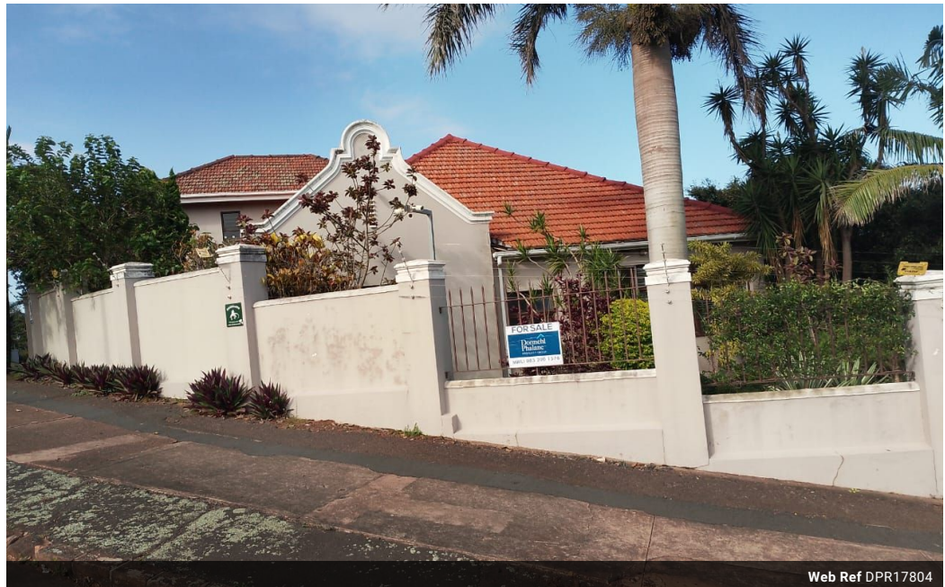
Web Ref DPR17804

3 Oslo Building 394 Ester Roberts Road Glenwood Durban 4001