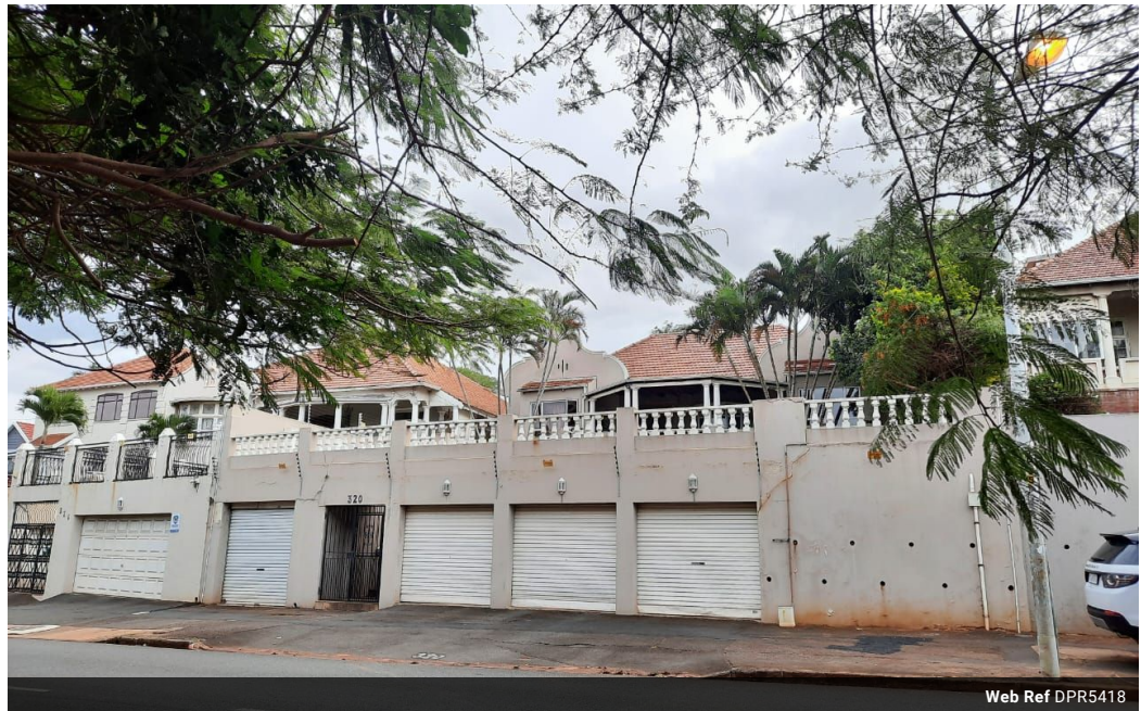
Web Ref DPR5418

3 Oslo Building 394 Ester Roberts Road Glenwood Durban 4001