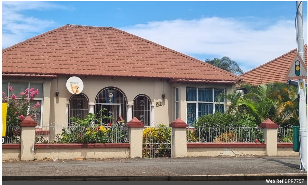
Web Ref DPR7757

3 Oslo Building 394 Ester Roberts Road Glenwood Durban 4001