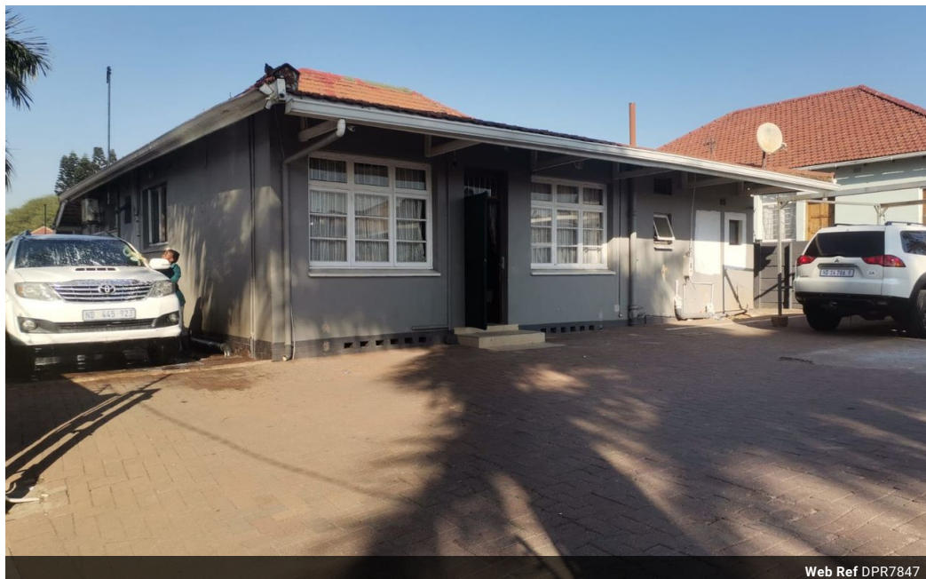
Web Ref DPR7847

3 Oslo Building 394 Ester Roberts Road Glenwood Durban 4001