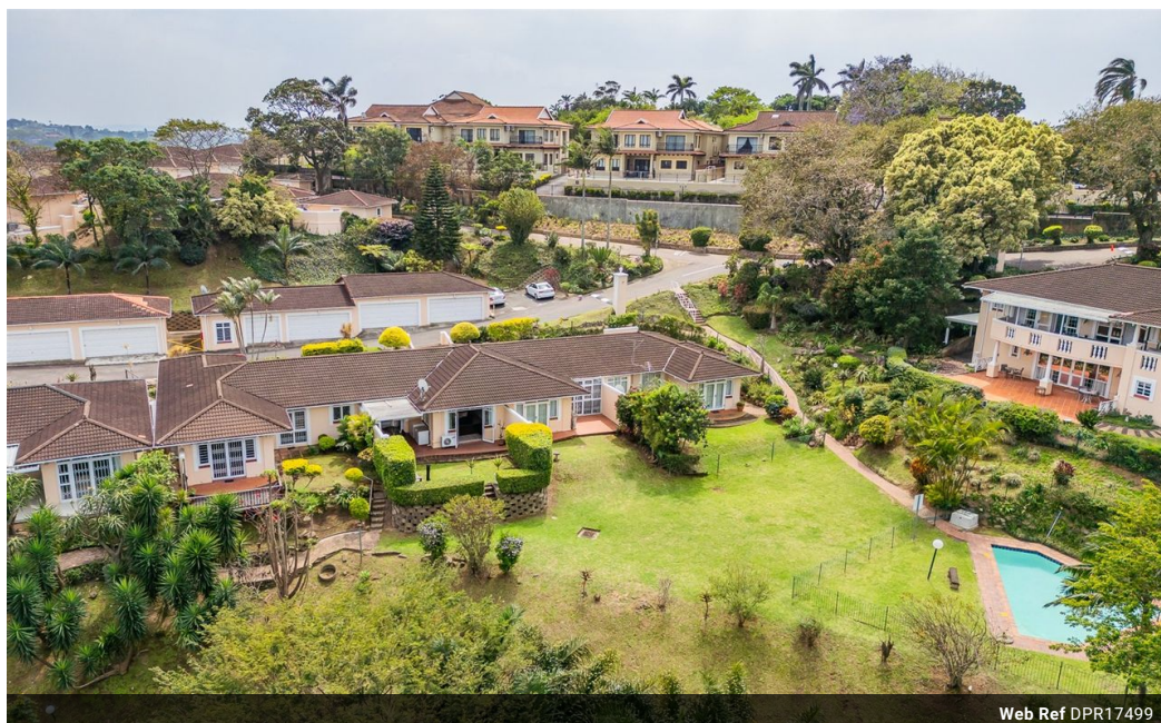
Web Ref DPR17499

Shop 1, Gordana Court, 22/26 Salisbury Avenue, Westville