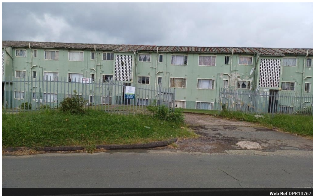
Web Ref DPR13767

Shop 2, 120 Stella Road Hillary Durban 4094