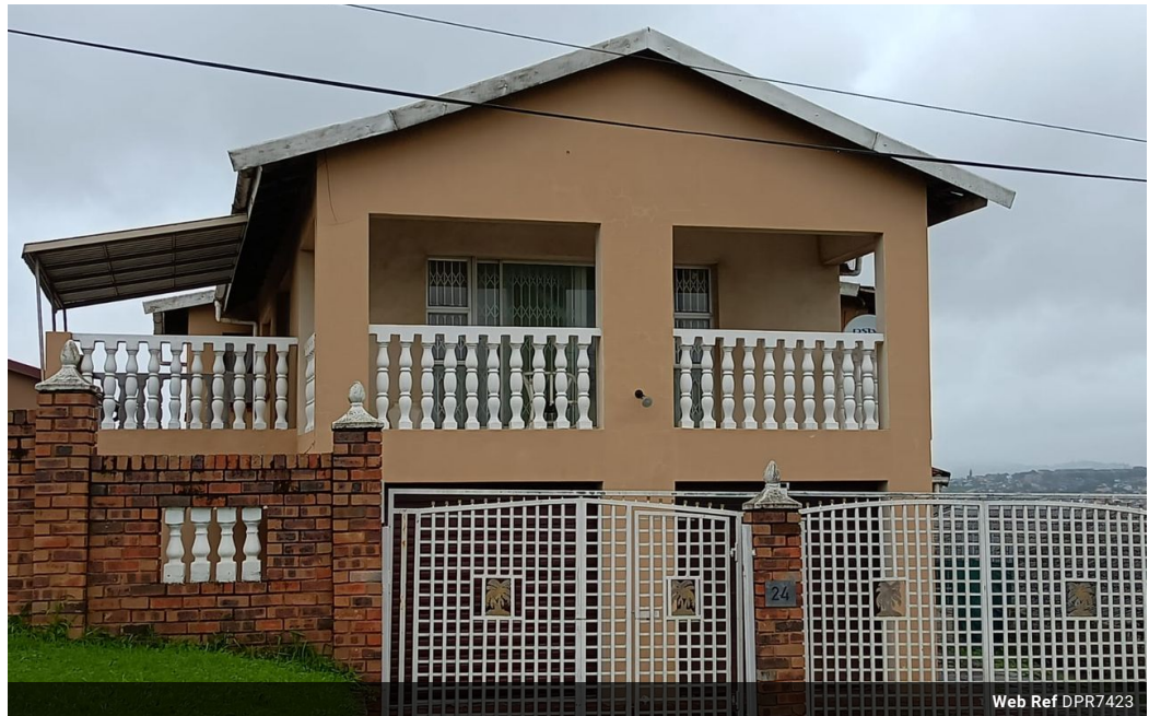
Web Ref DPR7423

558 Mountbatten Drive Reservoir Hills Durban 4090