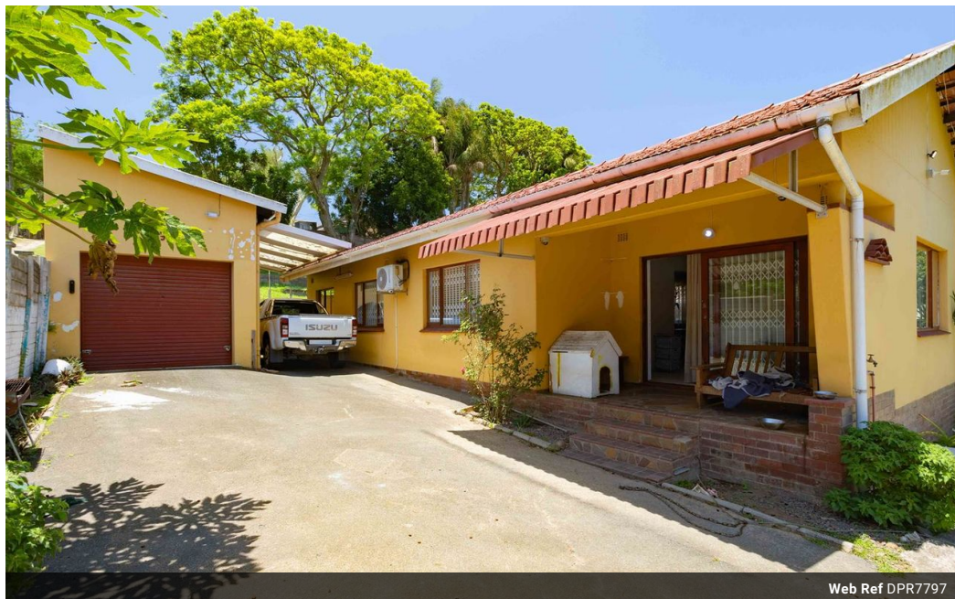
Web Ref DPR7797

Shop 2, 120 Stella Road Hillary Durban 4094