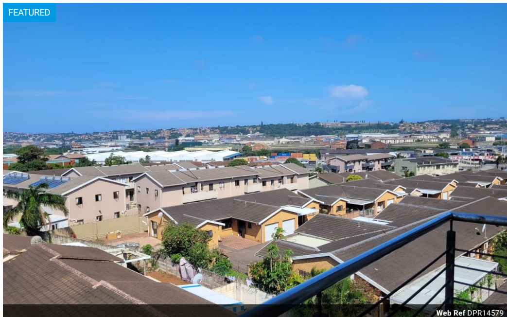
Web Ref DPR14579