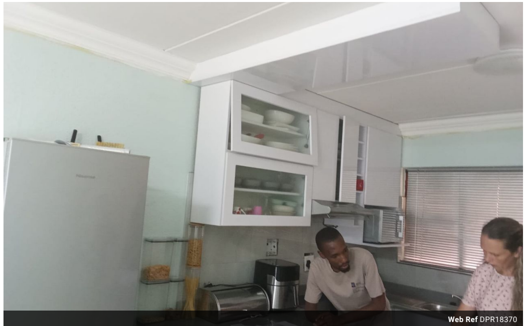
Web Ref DPR18370