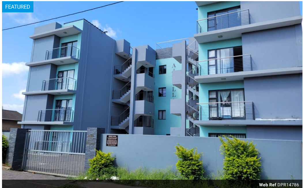
Web Ref DPR14786