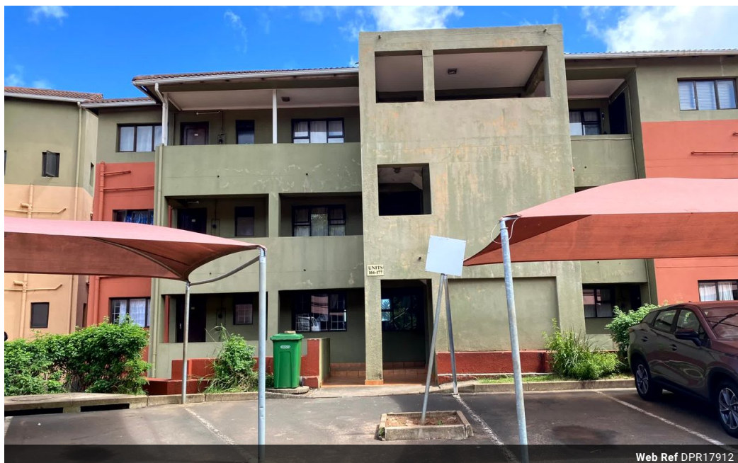
Web Ref DPR17912