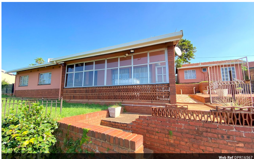
Web Ref DPR16567