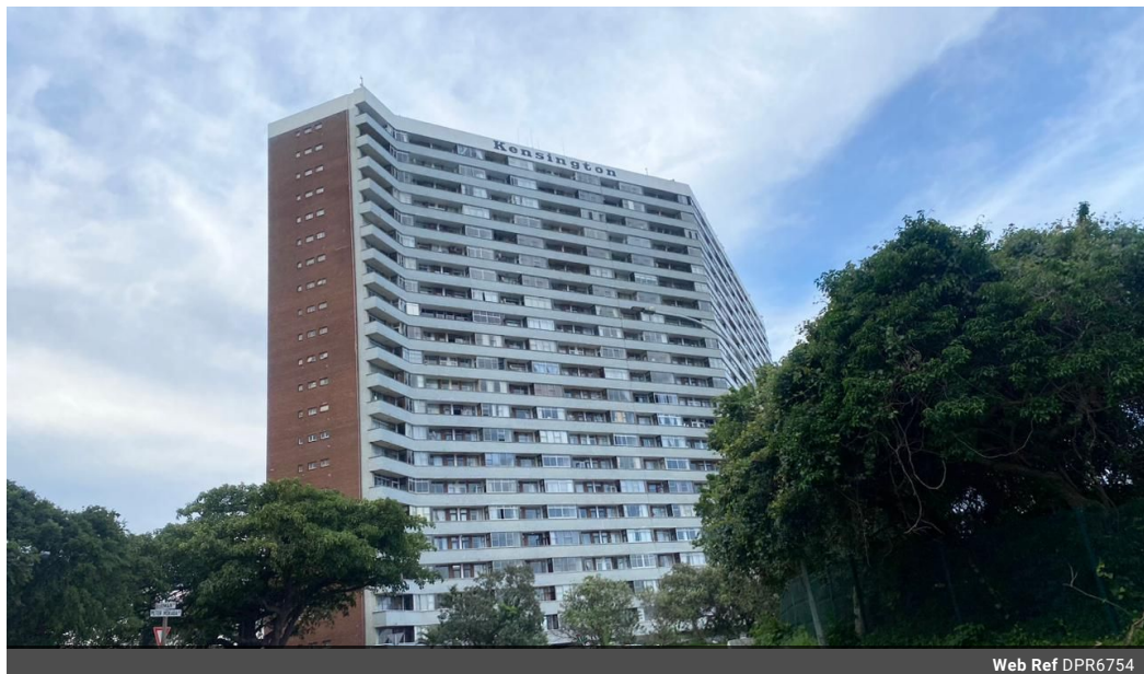
Web Ref DPR6754

558 Mountbatten Drive Reservoir Hills Durban 4090