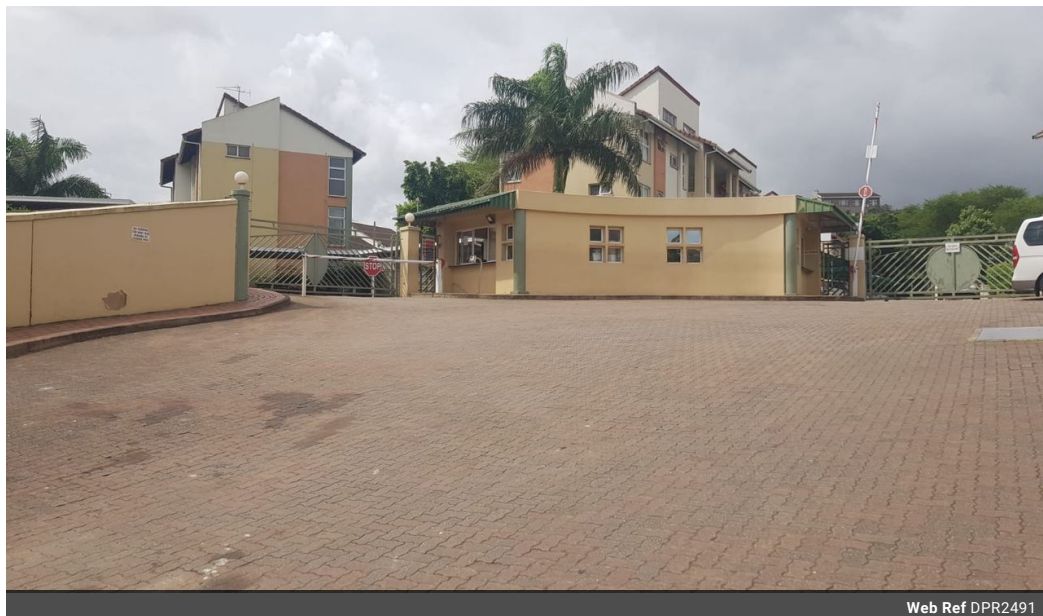
Web Ref DPR2491

3 Oslo Building 394 Ester Roberts Road Glenwood Durban 4001