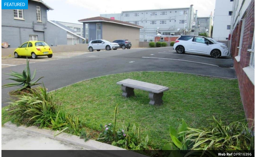
Web Ref DPR16396

279 Problem Mkhize Road, Essenwood, Durban, 4001