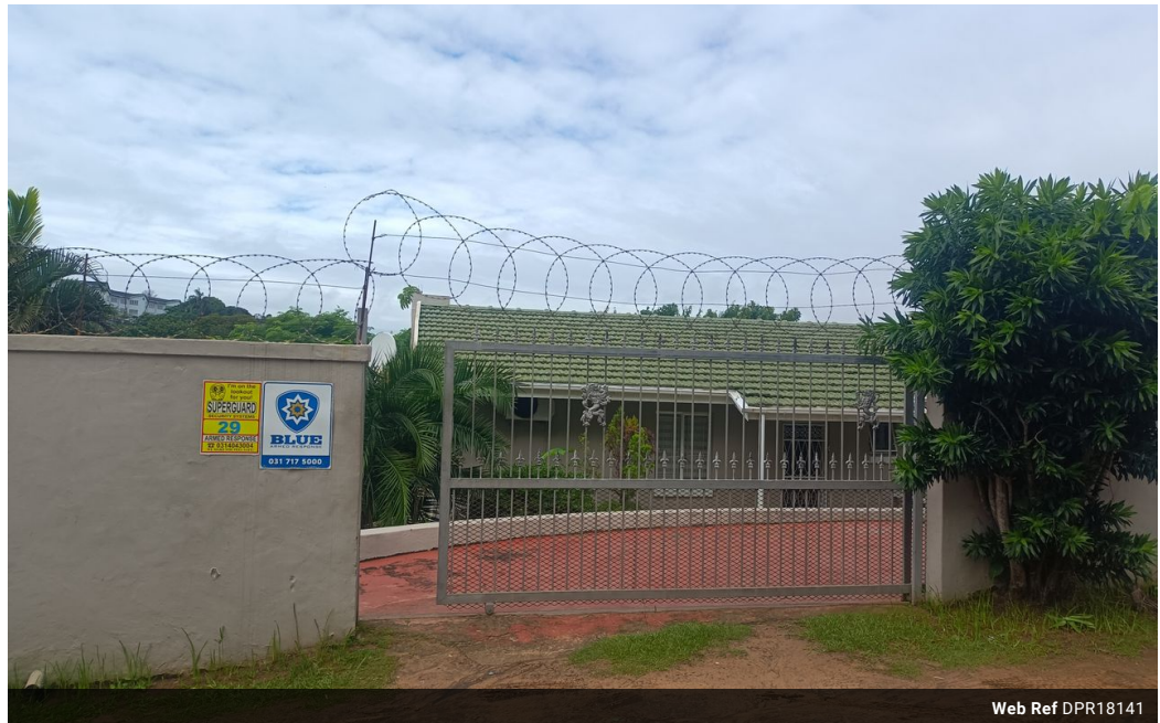
Web Ref DPR18141