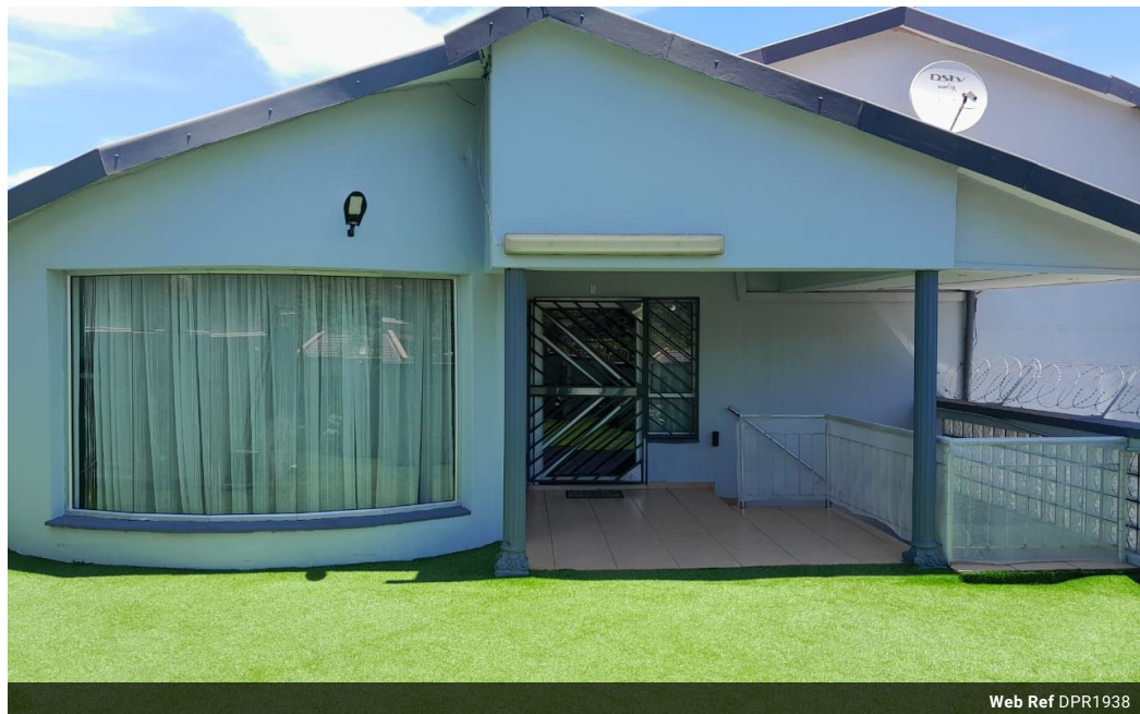
Web Ref DPR1938

279 Problem Mkhize Road, Essenwood, Durban, 4001