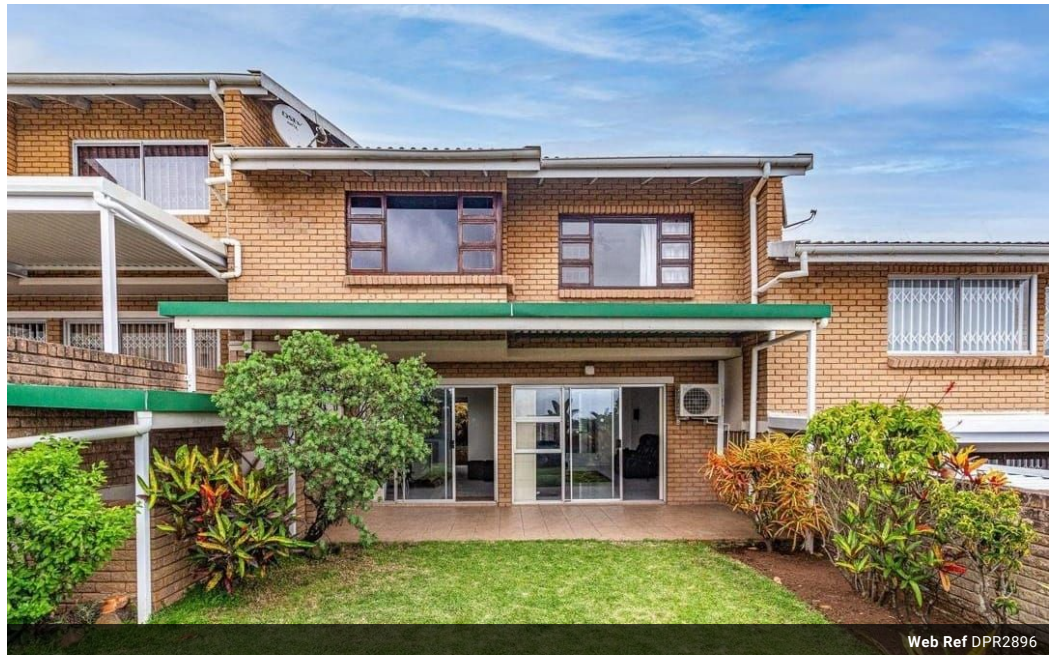
Web Ref DPR2896

3 Oslo Building 394 Ester Roberts Road Glenwood Durban 4001