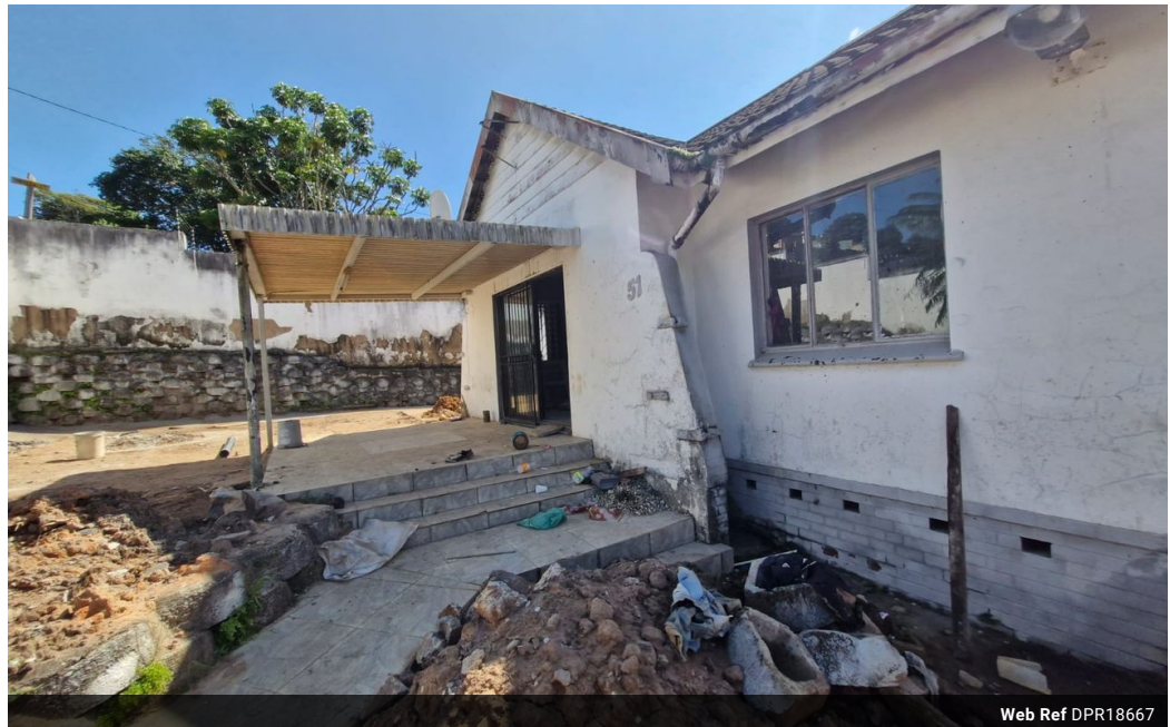
Web Ref DPR18667

Shop 2, 120 Stella Road Hillary Durban 4094