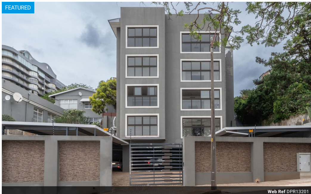
Web Ref DPR13201

279 Problem Mkhize Road, Essenwood, Durban, 4001