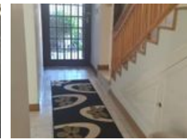
Web Ref DPR16134