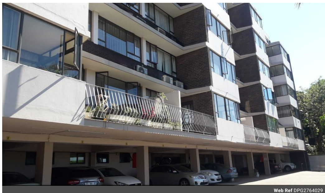
Web Ref DPG2764029

279 Problem Mkhize Road, Essenwood, Durban, 4001