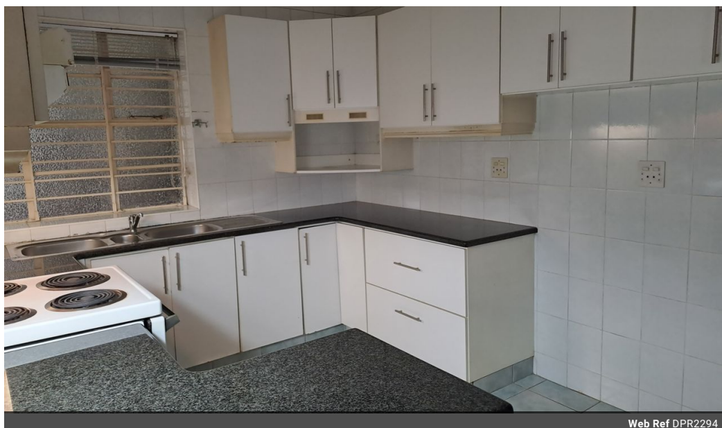
Web Ref DPR2294

3 Oslo Building 394 Ester Roberts Road Glenwood Durban 4001