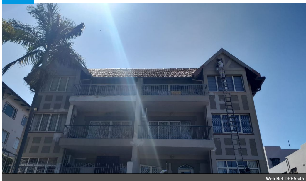
Web Ref DPR5546