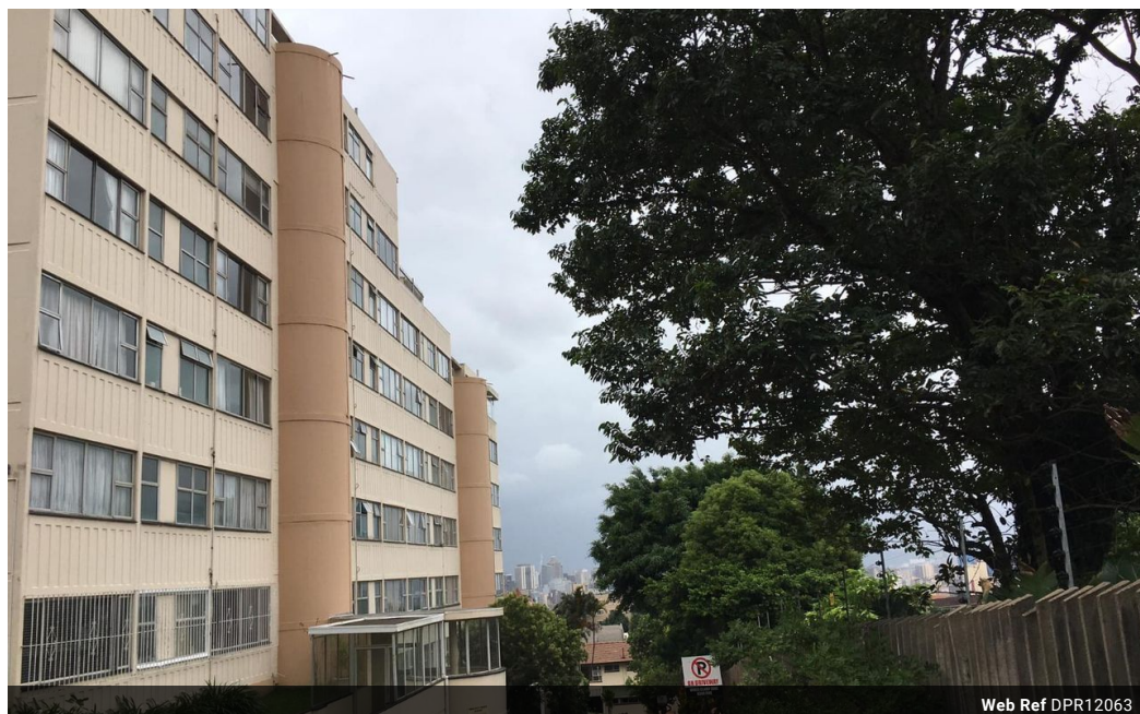
Web Ref DPR12063

3 Oslo Building 394 Ester Roberts Road Glenwood Durban 4001