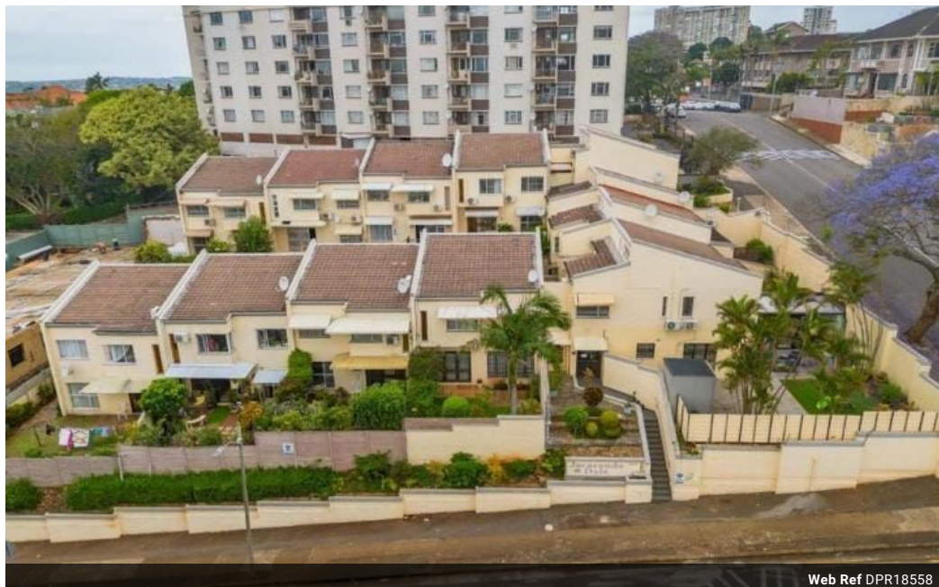
Web Ref DPR18558

3 Oslo Building 394 Ester Roberts Road Glenwood Durban 4001