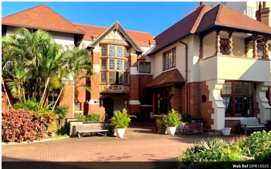
Web Ref DPR15535

3 Oslo Building 394 Ester Roberts Road Glenwood Durban 4001