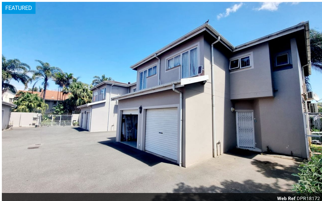
Web Ref DPR18172