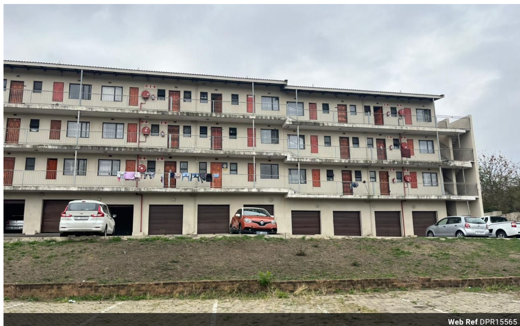
Web Ref DPR15565

558 Mountbatten Drive Reservoir Hills Durban 4090