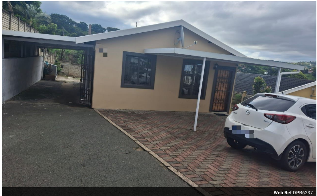
Web Ref DPR6237

558 Mountbatten Drive Reservoir Hills Durban 4090