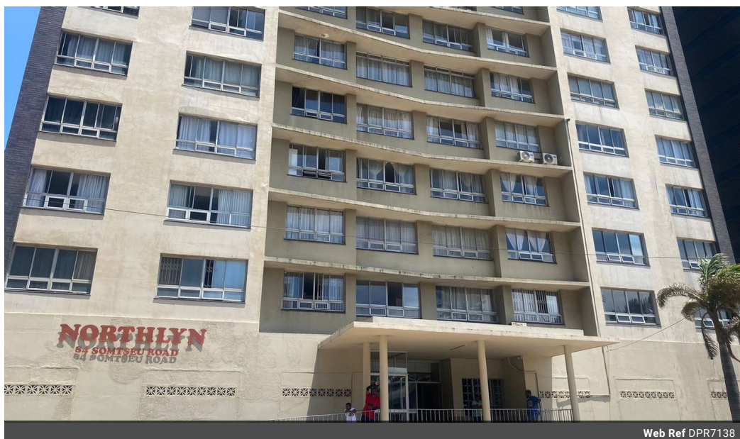
Web Ref DPR7138

558 Mountbatten Drive Reservoir Hills Durban 4090