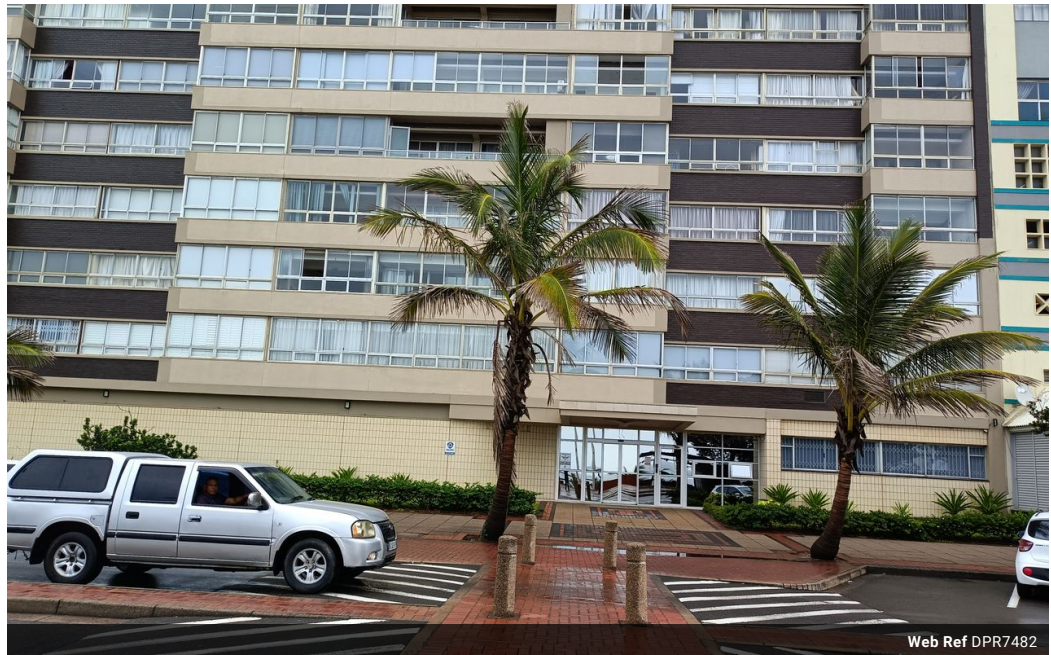
Web Ref DPR7482