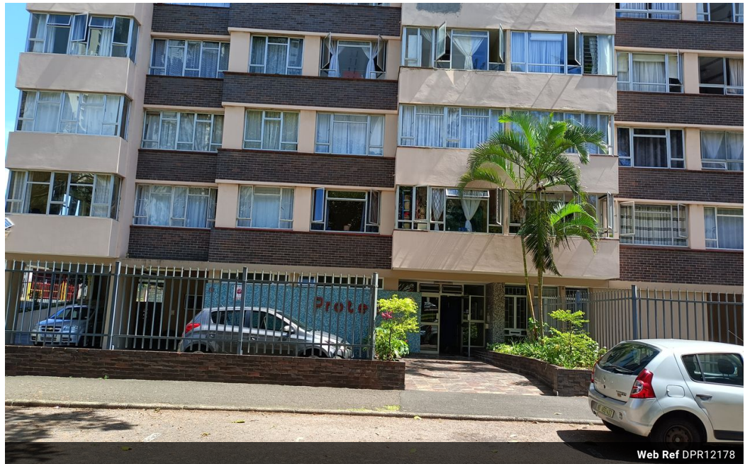
Web Ref DPR12178