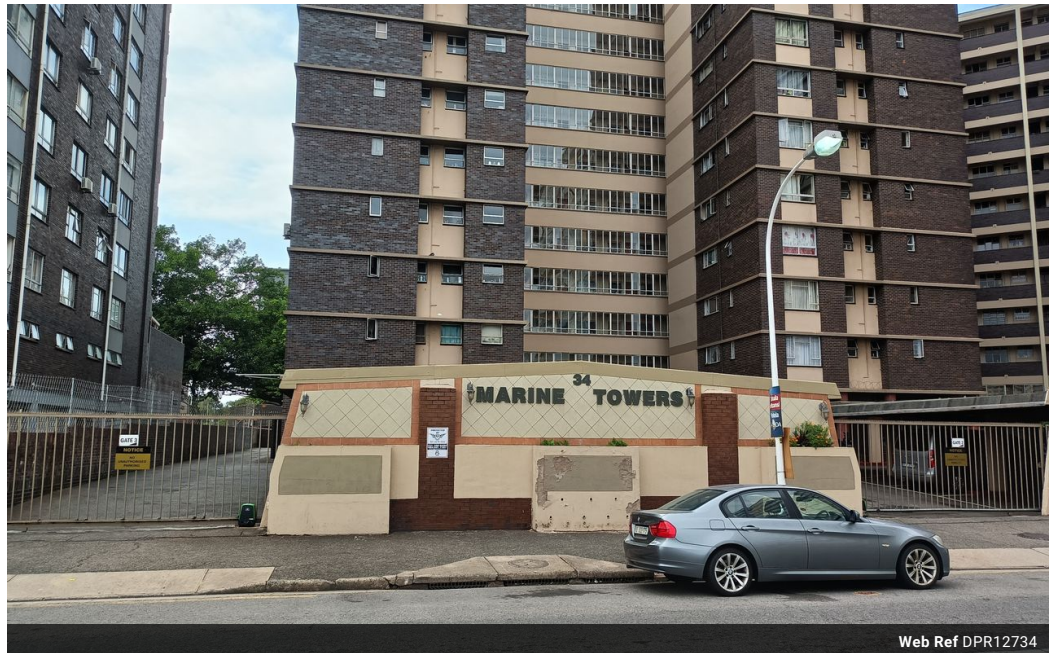
Web Ref DPR12734