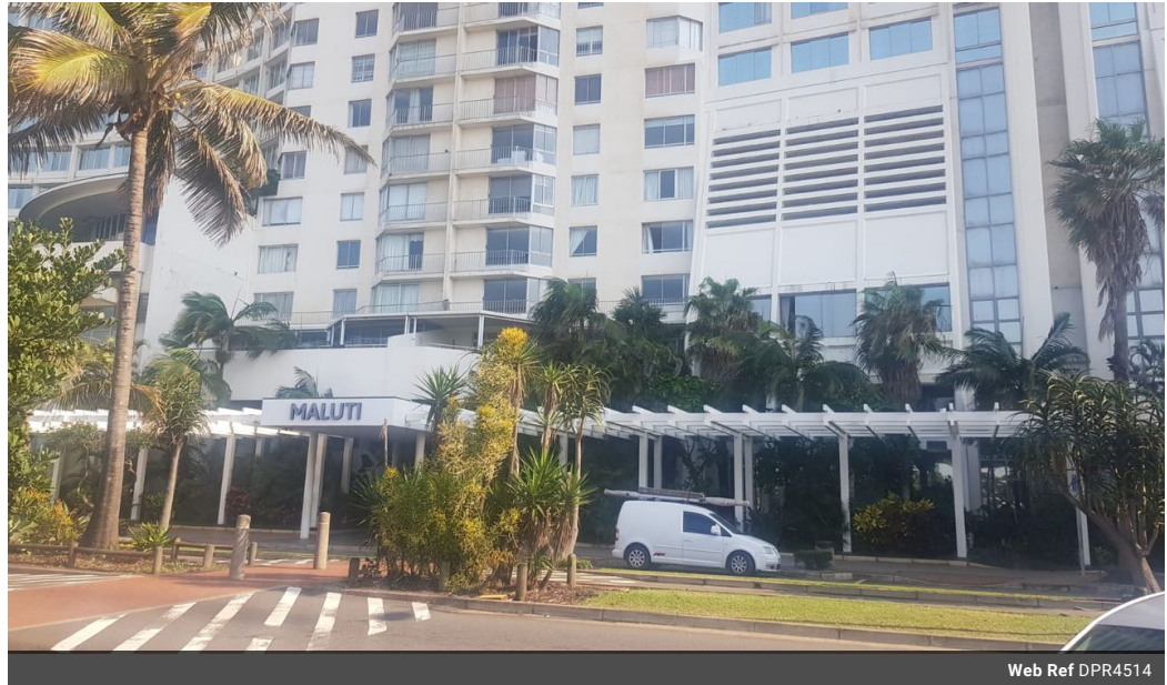
Web Ref DPR4514

3 Oslo Building 394 Ester Roberts Road Glenwood Durban 4001