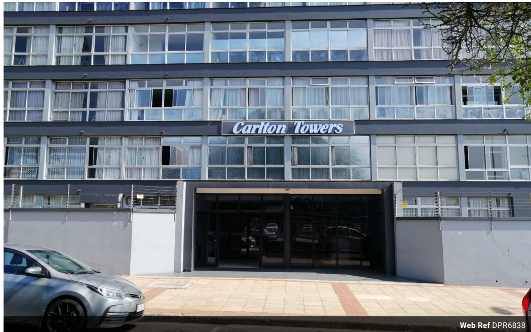
Web Ref DPR6838

3 Oslo Building 394 Ester Roberts Road Glenwood Durban 4001