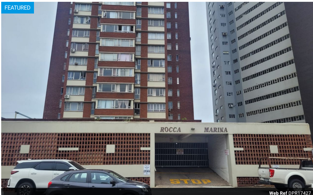
Web Ref DPR17427

279 Problem Mkhize Road, Essenwood, Durban, 4001