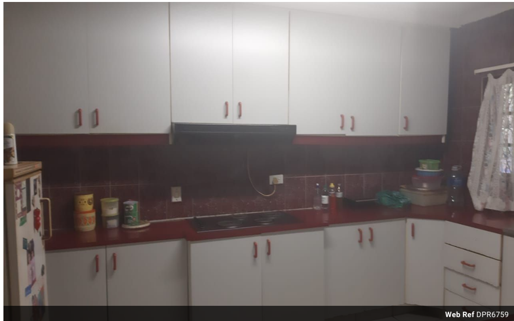
Web Ref DPR6759

558 Mountbatten Drive Reservoir Hills Durban 4090