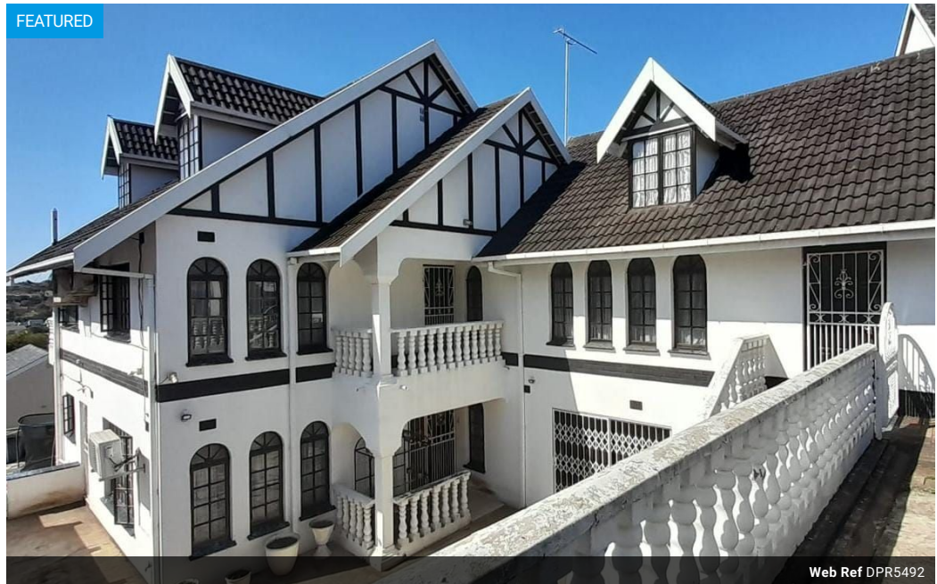
Web Ref DPR5492